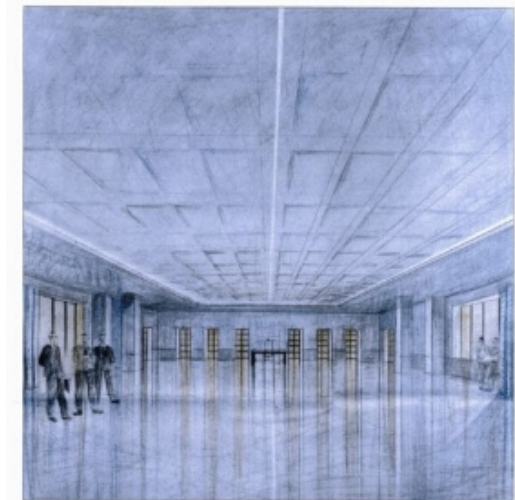
AULA MAGNA Progetto di illuminazione delle sale in 3D (loggi e nuova strutturazione delle pareti).