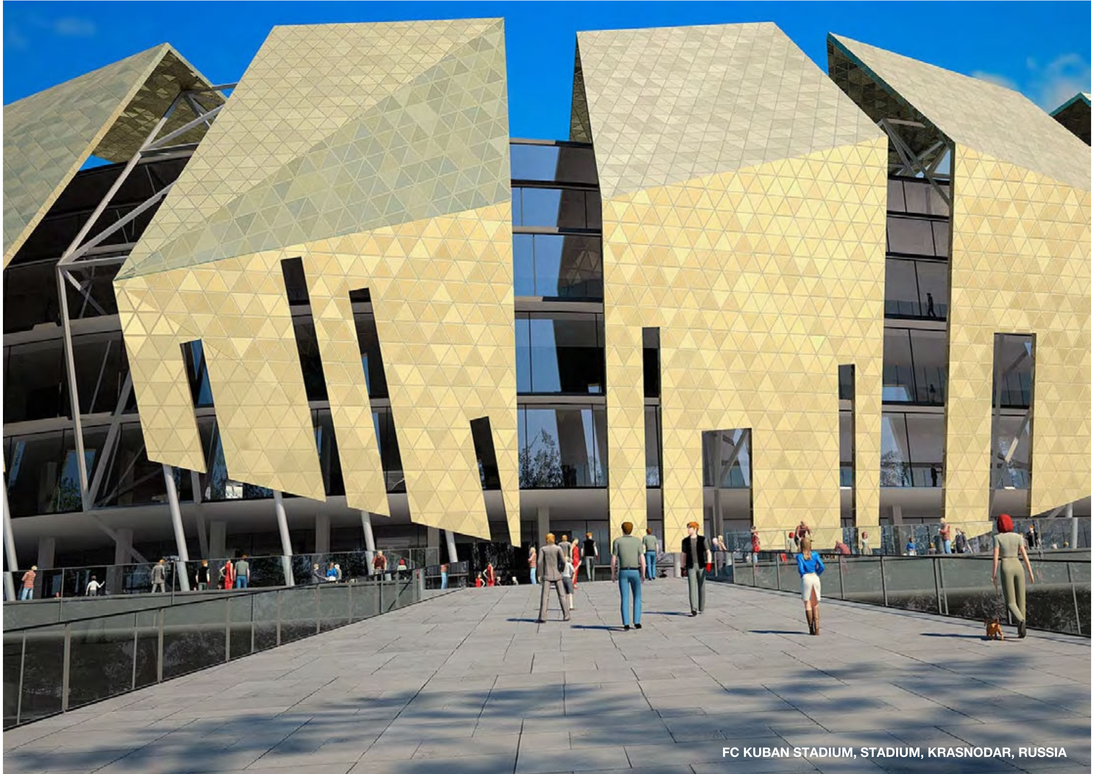
FC KUBAN STADIUM, STADIUM, KRASNODAR, RUSSIA